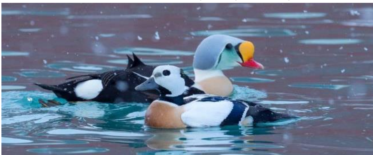
An incomparable male King and Steller's eider

In the waters we will especially search for the incomparable King and Steller's (both rare) and Common eider; Yellow-billed Loon; and Velvet and Common scoter. Song birds might include Ring Ouzel, Red-throated and