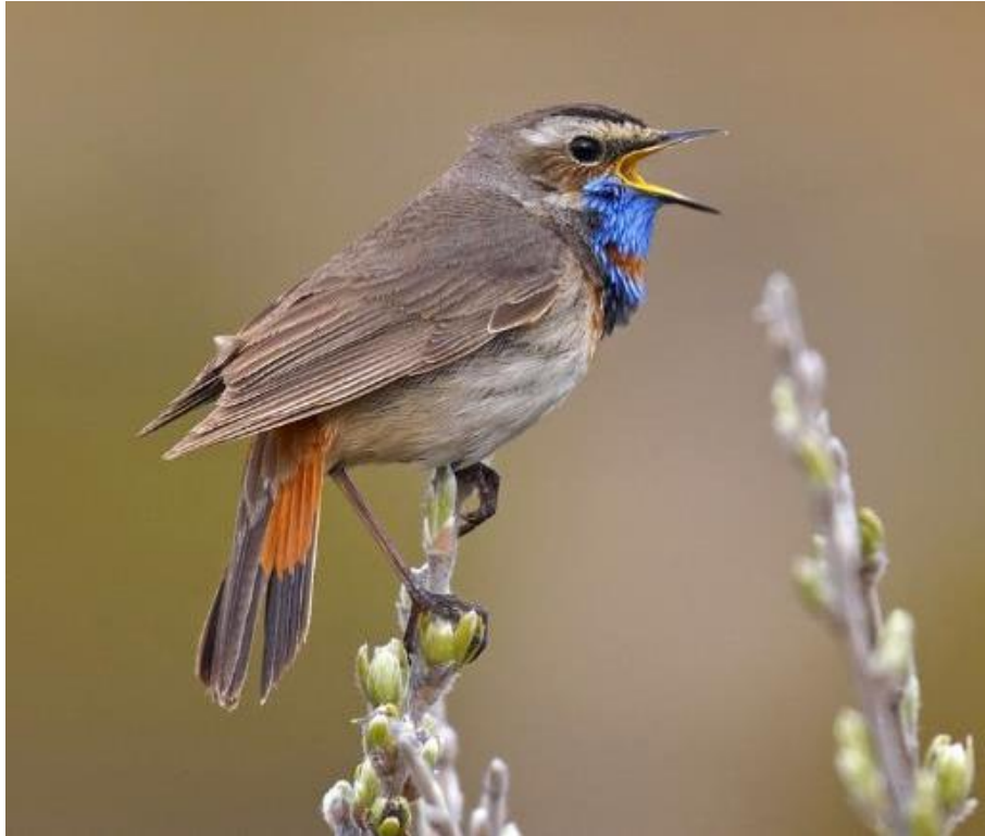
A magnificent singing male Bluethroat

Wheatear, Whinchat, Common Redstart and lovely Willow Ptarmigan in between their summer and winter plumage.