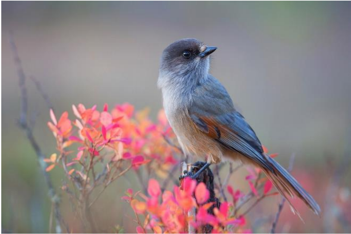
Siberian Jay is one of the classic species of the vast taiga forest.