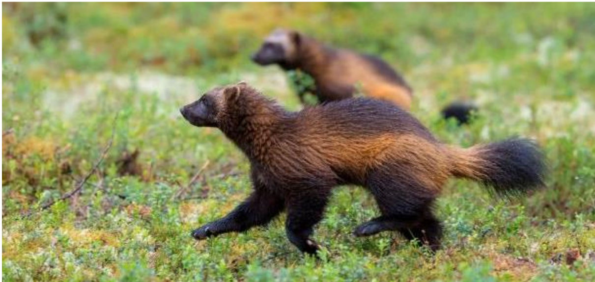
Playful Wolverines outside the comfortable Wolverine blind

This exciting pre-trip offers an exceptional opportunity to experience the Arctic's foremost wildlife of the vast Siberian taiga forests in Eastern Finland. This sparsely populated area (only 184,000 people) is simply brimming with natural Arctic beauty from lakes, rich wetlands, and forests of pine, birch and spruce. Planned primarily to enjoy the antics of two fascinating carnivores in this rarely visited and untouched wilderness, it's a dream come true to observe one of the most mythical carnivores in the world, namely the extraordinary Wolverine (multiple observations on all our previous trips)! Wolverines look something like a mixture of a dog, a skunk and a bear, with short legs, long hair and elongated snouts. They also have a distinctive mask of dark fur around their eyes and forehead, and a stripe of blond or ivory fur that runs from each shoulder to the base of the animal's tail. This trip is planned to visit during its peak season of activity, and without doubt will offer us plenty of great photographic opportunities, too.