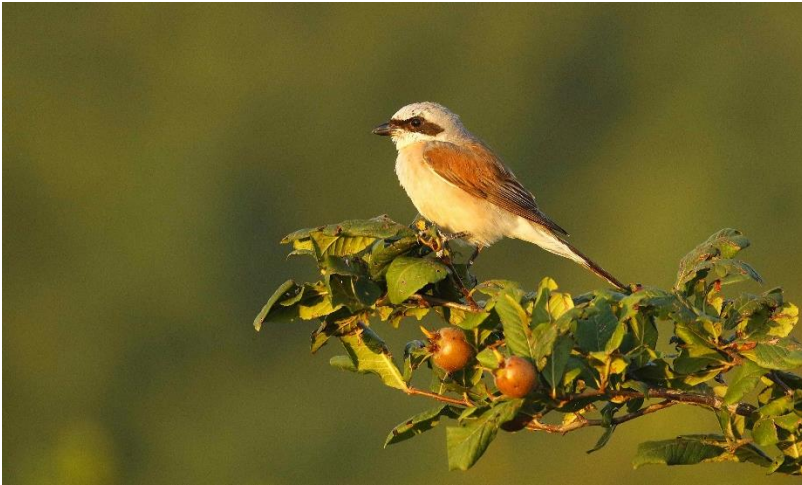
Red-backed Shrike

Here the wondrous musical song of Skylarks fills the air. Other species we might encounter include Common Kestrel, Gray Partridge, Northern Lapwing, Eurasian Curlew, European Goldfinch, and Tree Sparrow. Sought after Corncrake could be present and usually very hard to see, but we will do our best. Some years the area is even graced by nesting Montague's Harrier.