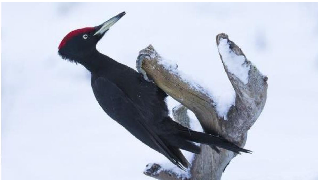
The Impressive Black Woodpecker

Bullfinch and Common and Parrot crossbills. Freshly arrived warblers from Africa should be in full song and we will be enchanted by the cascading songs of Wood Warblers and delightfully sweet voice of Willow Warblers.