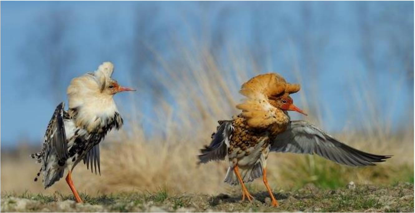
Male Ruff lekking will definitely be a trip highlight.

NIGHTS: Finlandia Hotel Airport Oulu, Kempele, Finland