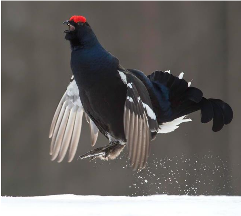
Lekking male Black Grouse have to be seen to be believed.

This is the western-most extreme of this boreal Siberian forest type and holds many rare plants and birds. During our stay, we should find breeding Red-necked Grebe in all their glory, Arctic Loon, wildfowl including Smew and Velvet Scoter, shorebirds such as European Golden-Plover, Common Greenshank, the minute Jack Snipe (rare), Green and Wood sandpiper and Spotted Redshank. Many of these are quite commonplace here. Oulanka is also wonderful for flowering plants including, with luck, both the Calypso and Lady's Slipper orchids, which can be seen, depending on blooming time.