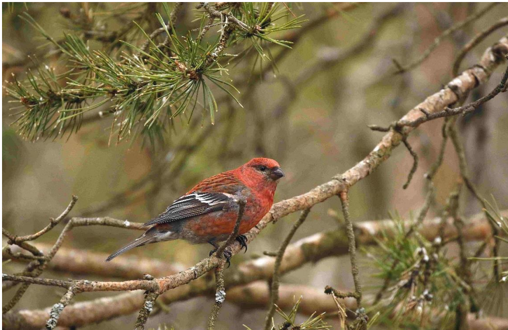
Stunning male Pine Grosbeak

We may even encounter moose wading through the remote bogs, while forests are also home to rare Forest Reindeer (seen on our last two tours) and the long-legged Mountain Hare (the most common mammals in this area). Other mammals include, Pine Marten, with both Stoat or Least Weasel being seen on our last two tours, Northern Bat and several species of vole and shrew.