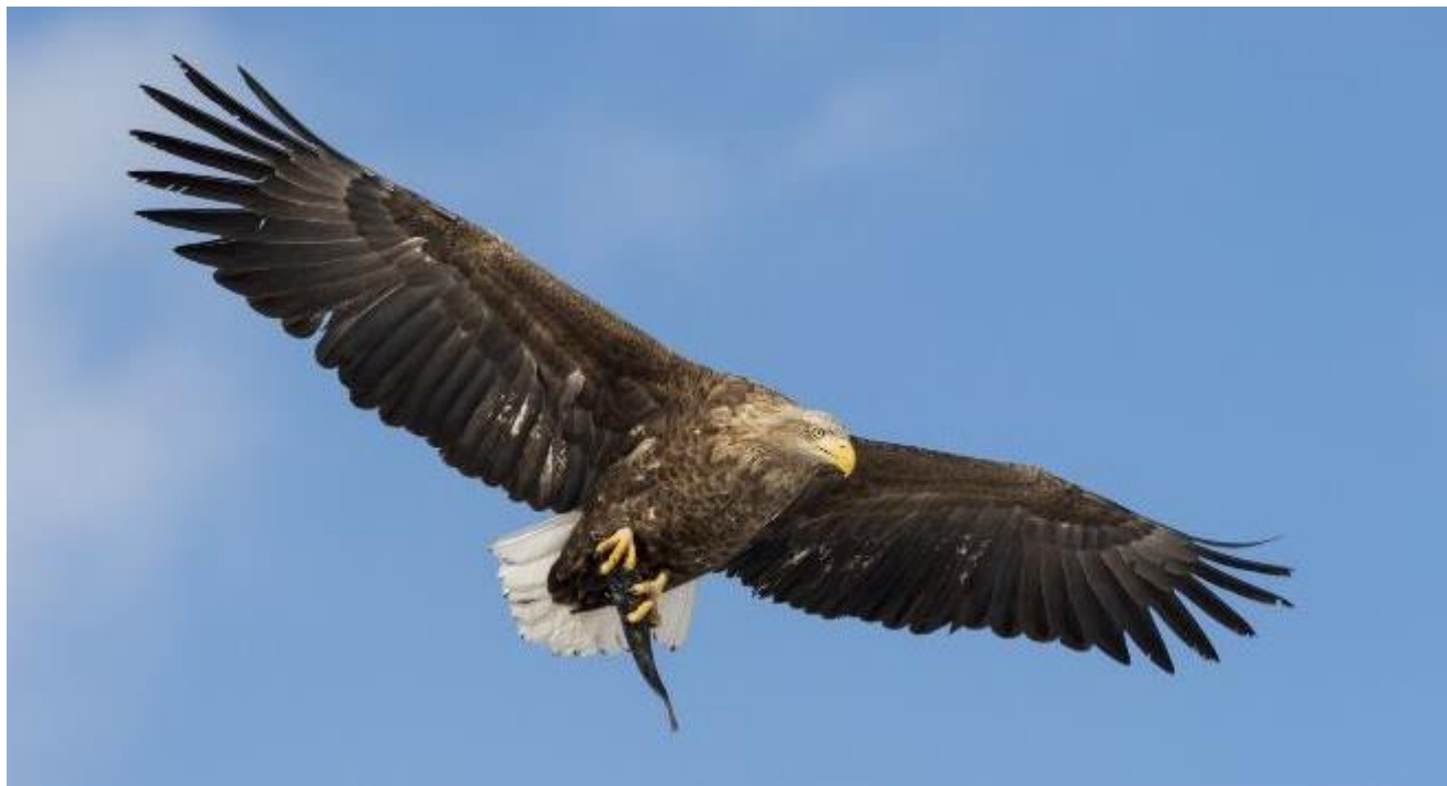
Huge White-tailed Eagles are fairly regular around the magnificent seabird cliffs.

Island. This nature reserve is the jewel in Varanger's natural crown—a wild island inhabited by 80,000 seabirds! Cliff ledges are crowded with thousands of breeding Common and Brünnich's murre, Black Guillemots, Razorbills, Eurasian Shag and some 7,500 pairs of Black-legged Kittiwakes, while grassy slopes hold enchanting Atlantic Puffins. Overhead the skies are often patrolled by immense White-tailed Eagles that hunt here on the stunning sheer cliffs. This is by far the best seabird viewing I have ever experienced and magical for photography.