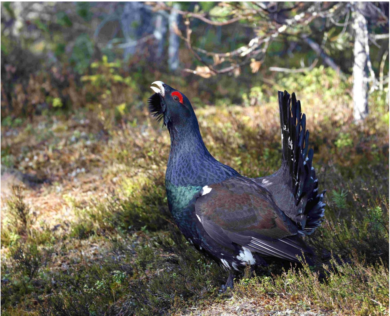
A magnificent male Western Capercaillie displaying.

Our trip is perfectly timed to enjoy the best of early spring as we follow this natural burst of life, offering many sought-after Arctic breeding specialties along with an excellent opportunity to experience exciting spring migration as countless water, sea birds, shorebirds and songbirds are arriving to enjoy breeding in the Land of the Midnight Sun. This tour has been meticulously designed, along with expert local birders, enabling us to highlight the best Scandinavian avian treasures, including many of Europe's most charismatic owls (up to eight species at known nesting sites), woodpeckers and no less than five incredible grouse species too, with magical Ruff displaying on leks!