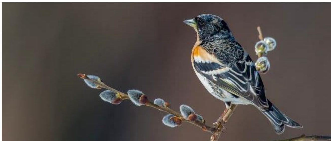
Brambling are a fairly common bird of Scandinavian forests.