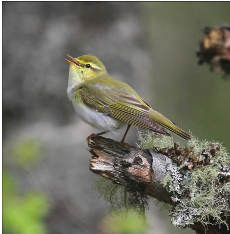
The Wood Warbler is a true delight.

NIGHT (May 12): Overnight aboard aircraft NIGHT: (May 13) Koli: Break Sokos Hotel on Top, Koli