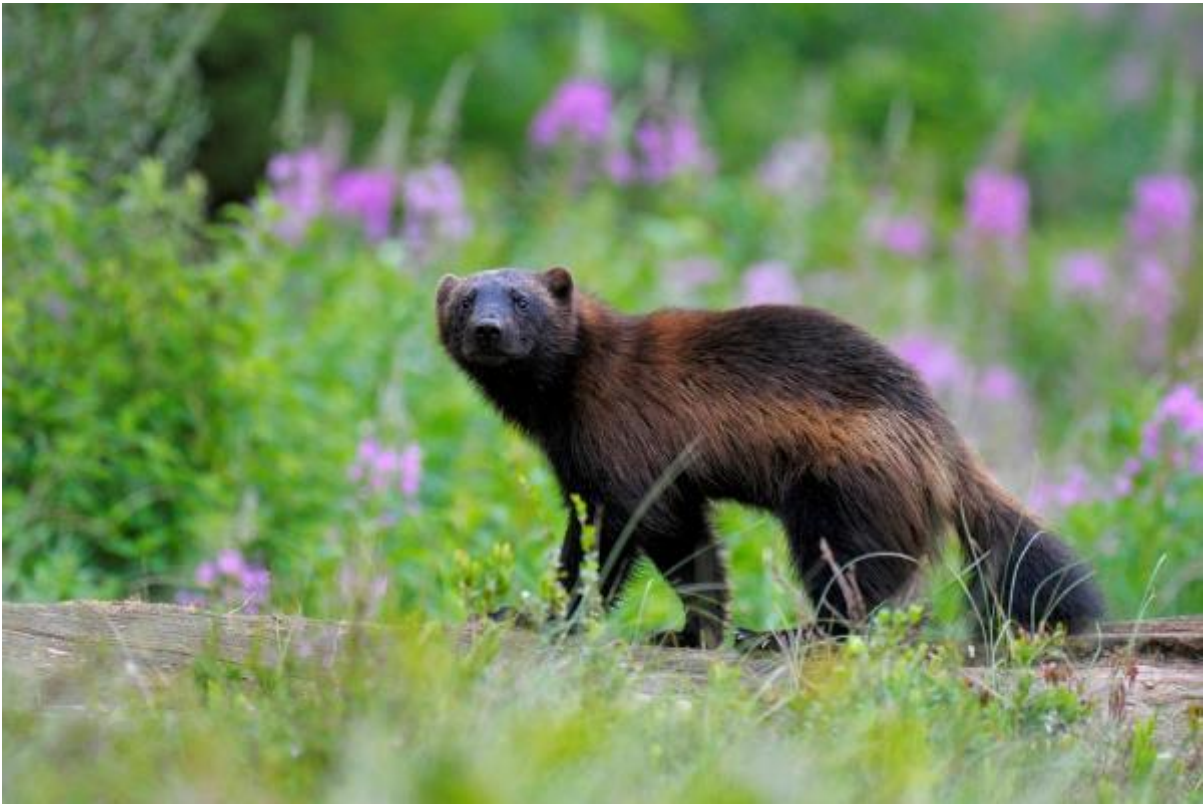
The poorly known Wolverine

May 14, Day 3: Morning Birding Koli National Park; Drive to Lieksa Hotel and Afternoon/Night in the Wolverine Blind. Early this morning we will have a few hours birding Koli National Park to search for anything we didn't see the day before. We plan to visit exquisite Lake Pielinen—home to Arctic and Red-throated loon,