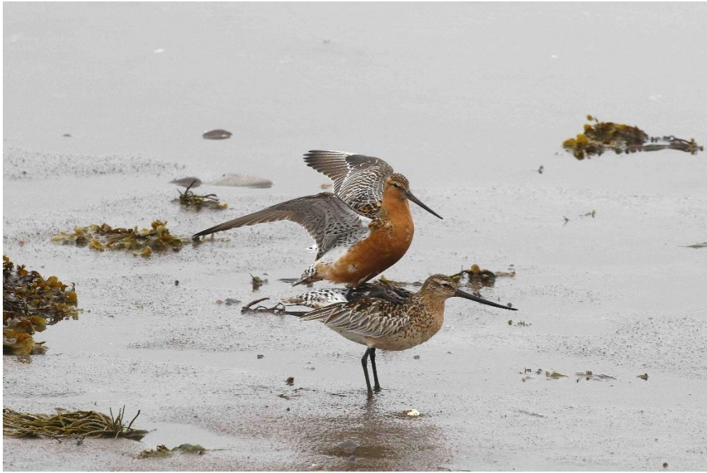
Spring and love is in the air - breeding plumage Bar-tailed Godwit.

We have previously observed Red Fox and Lemmings. A reintroduction of the endangered Arctic Fox is ongoing here but we would be very lucky to come across this tiny, delicate northern fox. After driving through an impressive deep tunnel for three km, we'll come out into the pleasant island town of Vardo, our home for the next three nights. The Black-legged Kittiwake certainly love the town as hundreds nest on the buildings. Time allowing, we can visit the nearby Memorial Site commemorating the execution in 1621 of 91 people for witchcraft, which is in an easy 5-10 minute walking distance from our hotel.