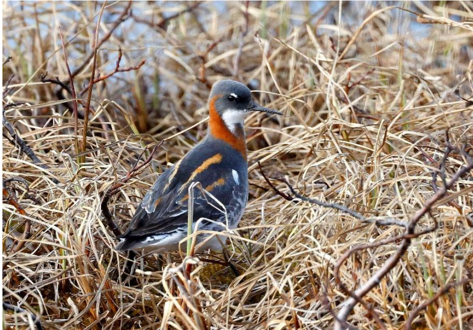
Red-necked Phalarope female

We will also enjoy excursions to Hamningberg, which is often referred to as the very end of Europe. The magnificent and colorful tundra is simply bursting with life and holds some very impressive birds, especially a huge population of shorebirds (all in wonderful breeding plumage): Wood Sandpiper, Dunlin, Purple Sandpiper, Temmink's Stint and Eurasian Whimbrel. My favorite, without doubt, is the gorgeous Red-necked Phalarope females that are truly radiant in color.