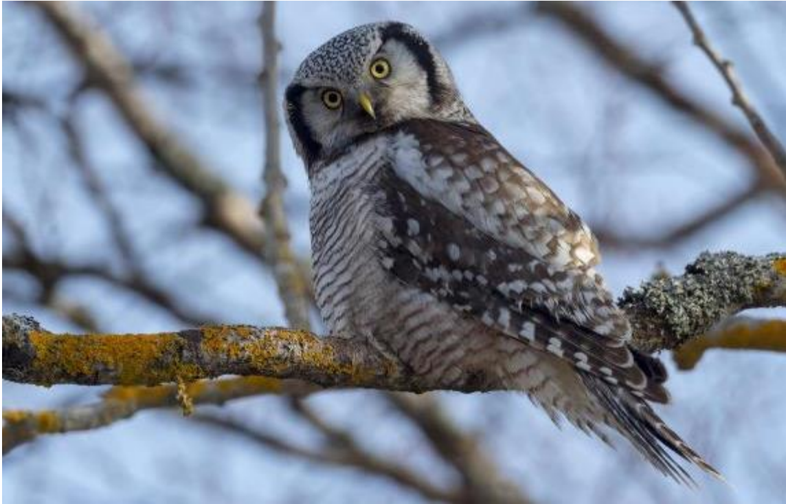
Northern Hawk Owl

Black or even Hazel grouse are also possible. Songbirds should include Fieldfare, Crested Tit, Eurasian Bullfinch, Yellowhammer, Wood Warbler, Common Rosefinch and Great Gray Shrike (rare) among several other interesting species that breed in the area.