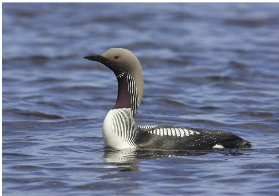
Breeding plumaged Arctic Loon

first eiders of the tour. Soon we start climbing uphill and leave the tree line behind. The highlands and arctic tundra in the Varanger Peninsula are simply bursting with life. Breeding waders and wildfowl offer some absolutely wonderful birding and the species list is truly appreciable; Rough-legged Hawk, Bluethroat, and Willow Ptarmigan occupy the river valleys while Lapland Bunting, Shore Lark and Long-tailed and Parasitic jaeger can be found on the hillsides. Most adapted are the Rock Ptarmigan, Snow Bunting and Dotterel which choose to stay on the barren hilltops. Roadside lakes provide excellent birding with Red-throated and Arctic loon,