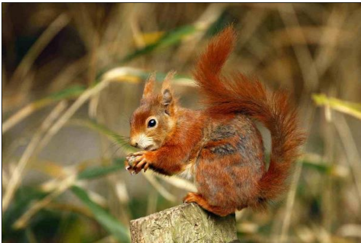
A charming European Red Squirrel

NIGHT: Hotel Puustelli, Lieksa / Wolverine blind