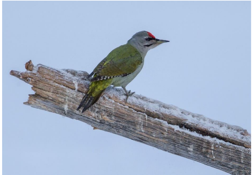
Gray-headed Woodpecker

These include the bizarre Wryneck (rare), Great Spotted, diminutive Lesser Spotted and highly localized Gray-headed Woodpecker. White-backed Woodpecker is the rarest, but we hope to have a good site to find them. Other forest gems include shy Hawfinch; Pied and Spotted flycatcher; Wood warbler; Chiffchaff; Blackcap; Garden Warbler; Eurasian Wren; Goldcrest; Great, Blue and Coal tit and; Eurasian Bullfinch. We will also visit some old growth boreal spruce and pine forests, where we will try to locate Red-breasted Flycatcher, Greenish Warbler, and Eurasian Treecreeper. In some years with good production of pine and spruce cones, we have good chances of encountering both Parrot and Red crossbill.