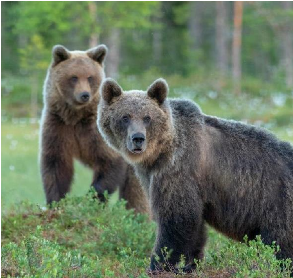
European Brown Bear from bear blind

scientific name, Gulo, means glutton. Meanwhile, the Brown Bear is the largest predator in Europe, feeding on anything it can find or catch, ranging from berries to fish and other mammals. Adult males can weigh a massive 300 kilos or 660 pounds. Despite their big size, Brown Bears are agile and males can travel hundreds of kilometers in a short period of time; females and cubs inhabit smaller territories.