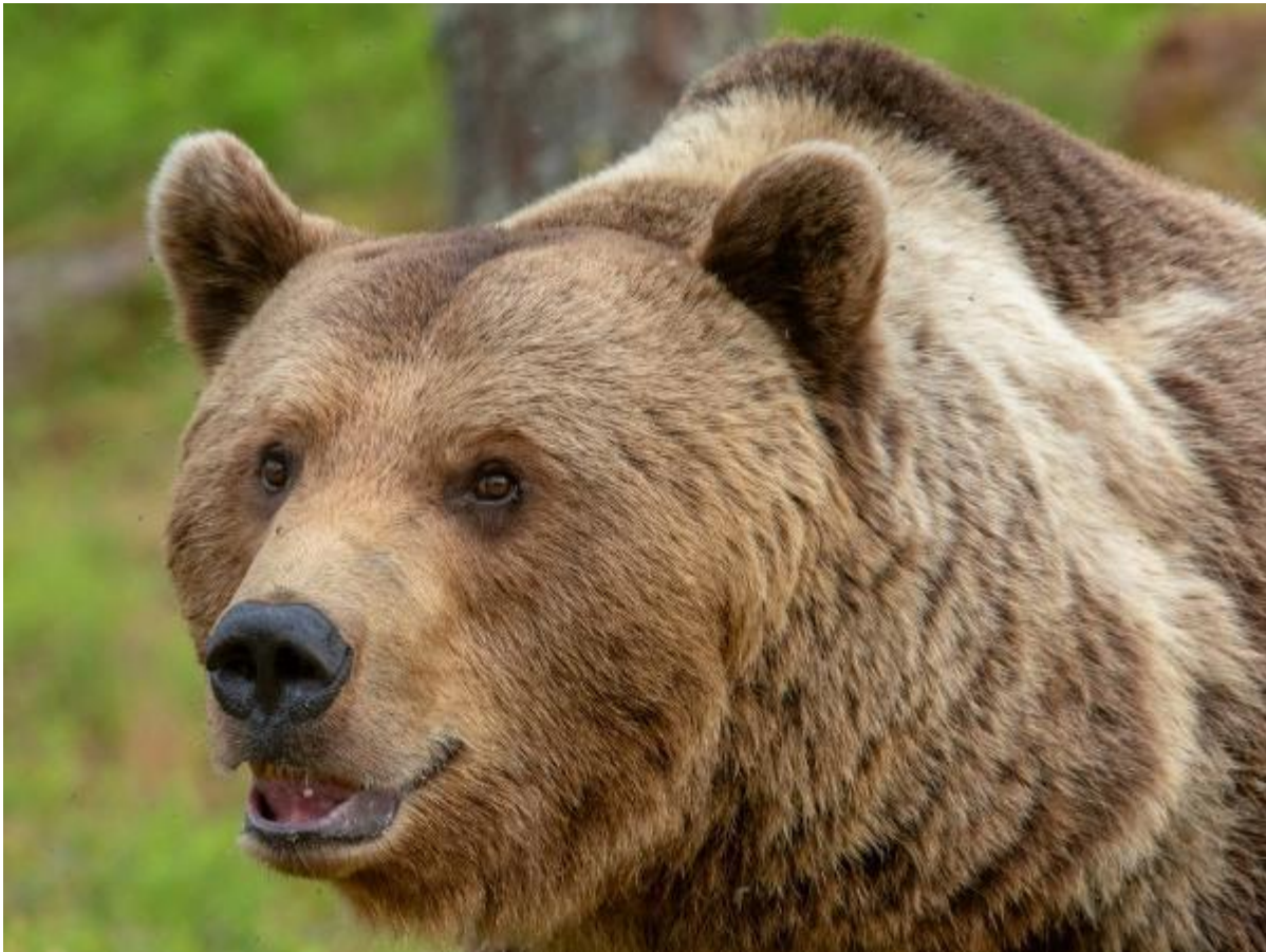
European Brown Bear taking a close look outside the blind

NIGHT: Boreal Wildlife Centre, Kuhmo / Bear blind