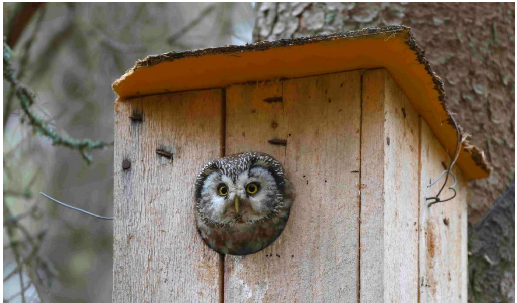
A cute Boreal Owl inspects us.

Continuing eastwards towards Kuusamo and closer to Russia, we find a land of lakes, bogs and extensive forested hills providing habitats for Taiga Bean Goose, Great Crested and Red-necked grebe,