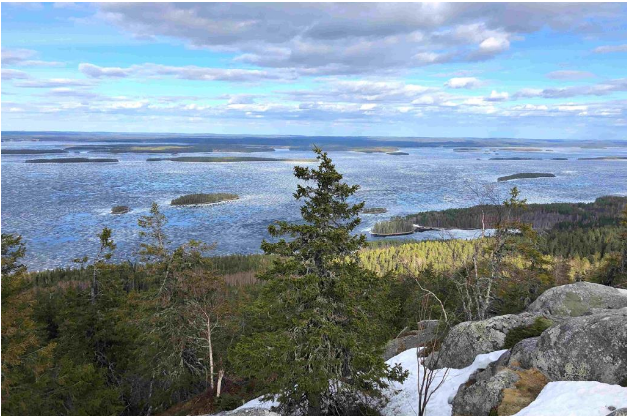
Pristine boreal forest holds many exciting Arctic and Siberian specialties.