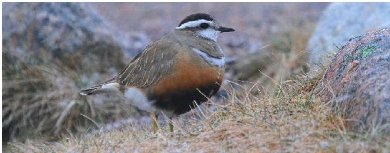
Striking Eurasian Dotterel breed on the tundra.

Apart from a splendid list of very unusual Arctic birds, the tour should be a delight for the stunning, unspoiled and varied scenery, and the excitement of civilized, safe and comfortable travel into some of the most remote wilderness areas northern Europe has to offer. The Finns (after the Brits!) are some of the keenest birders in Europe and there is a wealth of local knowledge from our Finnish co-leaders to assure that we have the best possible opportunities for finding the most sought-after birds. The Birding Hotline will likely direct us to a number of rarer species also; in 2022 we had a lovely male Pied Wheatear! The road systems, transport, hotels and meals are all (as we might expect from Scandinavia) of a high standard. Several of the national parks have excellent trails, visitor centers, blinds and observation towers to make our birding here an even more pleasurable experience.