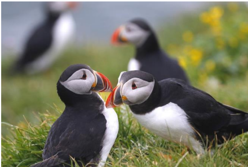
The rock star of northern seabird colonies is the Atlantic Puffin.

May 27-28, Day 11-12: Varanger Fjord and its Famous Hornøya Island & Barents Sea. This region of Norway offers more spectacular scenery of rugged, rocky coast; magical tundra; and fjord coastlines typical of the high Arctic. Vardö is, in fact, an island off the very northeastern-most tip of Norway. An important year-round fishing town, it is connected to the mainland by tunnel, allowing us easy access to this remote and exciting region. Seabirds, shorebirds all in delightful breeding plumage, and wildfowl will be our special aim here—some unique to this part of the world, others more circumpolar, but nonetheless highly sought-after.